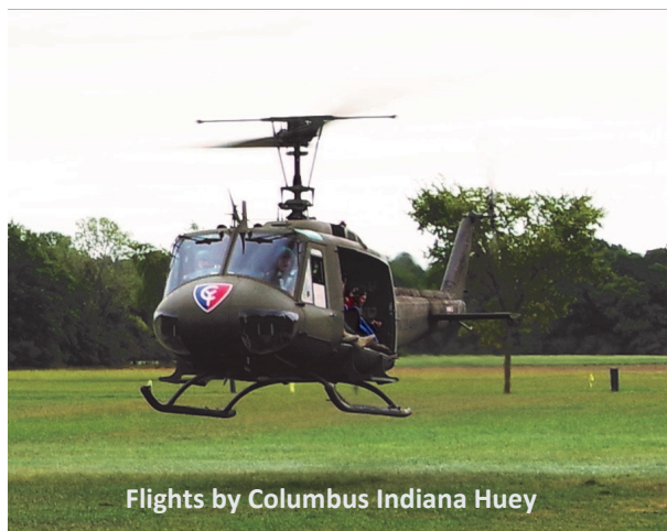
Flights by Columbus Indiana Huey

MILITARY VEHICLE SHOW & SWAP MEET Fri. 9AM-4PM & Sat. 9AM-3PM, September 20-21, 2024